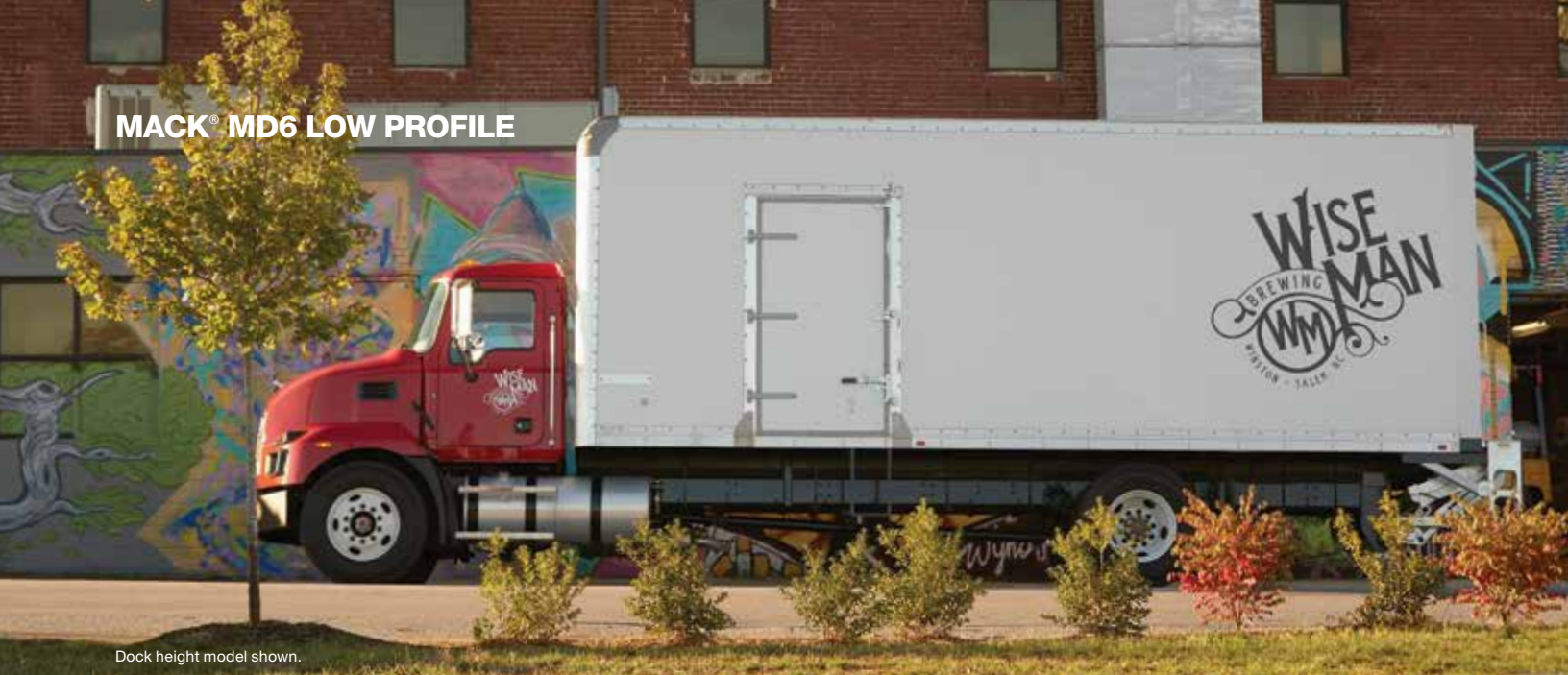
Dock height model shown.