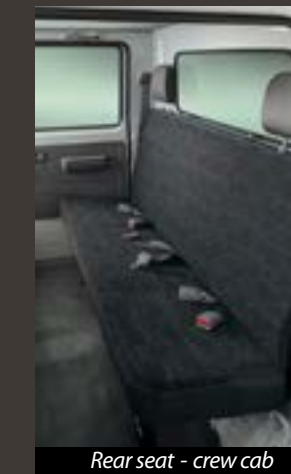
Rear seat - crew cab