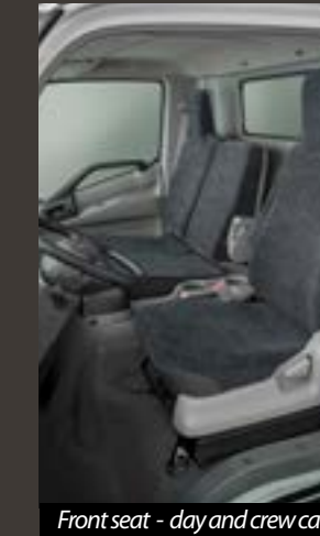
Front seat - day and crew cab